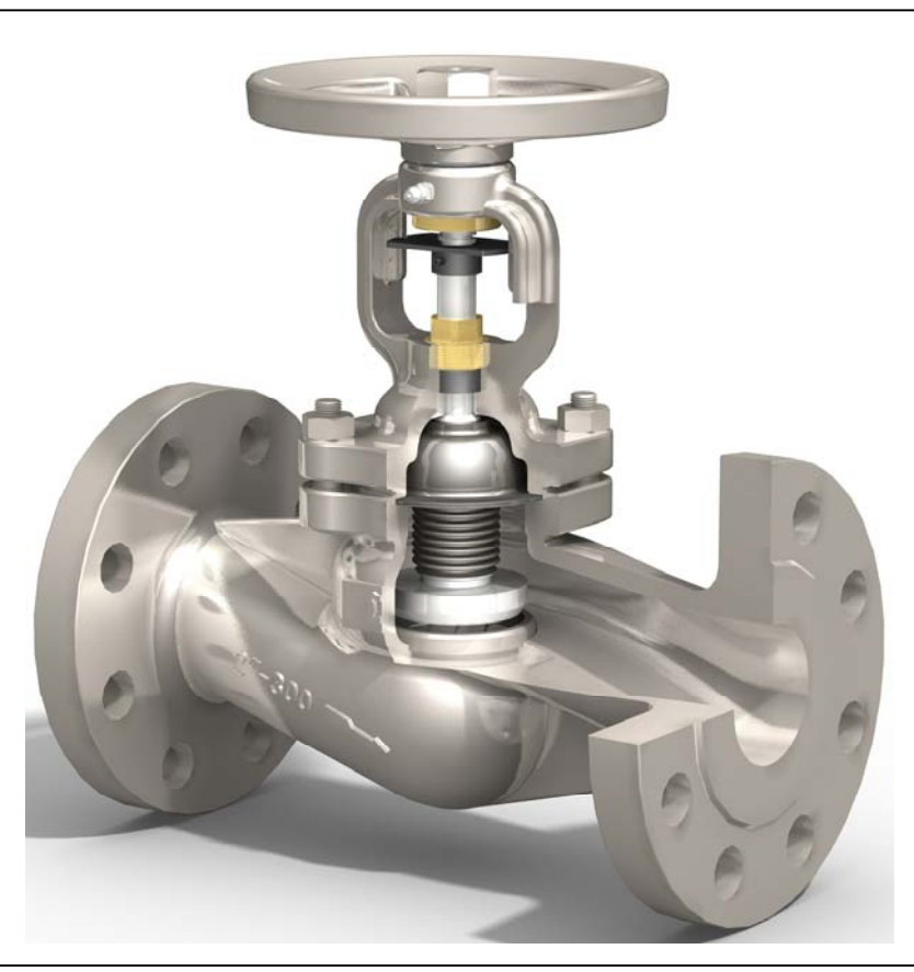
FIG FL37 Series