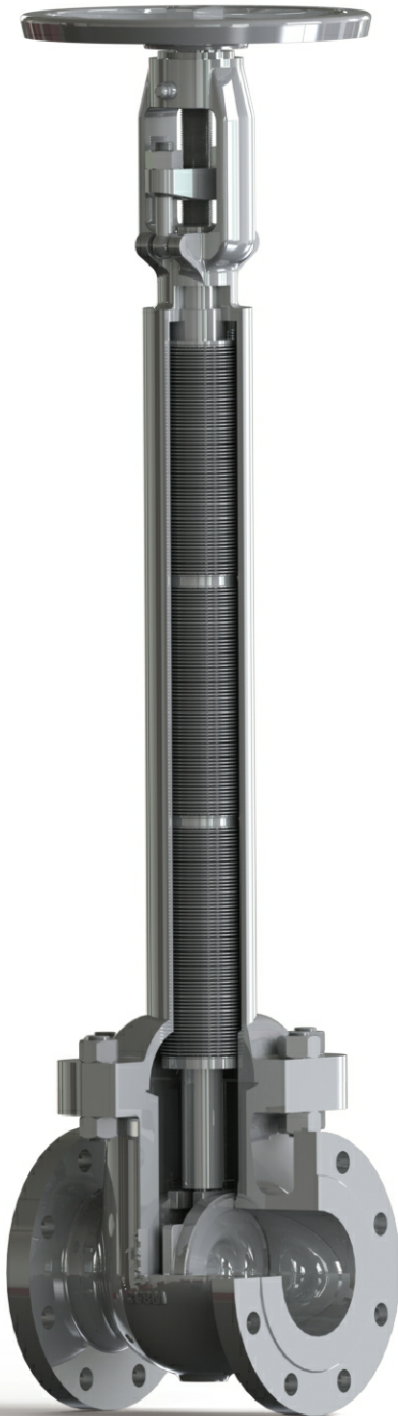
FIG FN49 Series